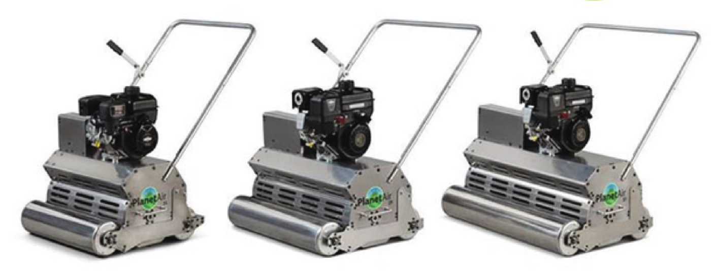
PlanetAir 21 | PlanetAir 29 | PlanetAir 37

Introducing three innovative, low-cost walk-behind turf aerators in 21 inch, 29 inch and 37 inch widths. By swapping tines, these aerators can create deep vertical cuts or pull cores and process them right inside the machine.